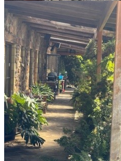
Just a few photos from the aviary visits we had in January 2025 some more next month